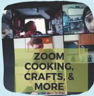
ZOOM COOKING, CRAFTS, & MORE