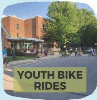
YOUTH BIKE RIDES