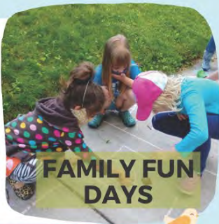
FAMILY FUN DAYS

It's certainly been a different summer than we anticipated, but we are so grateful for creativity and technology that's allowed for continual connection within our community! Our children, youth, and their families explored and celebrated and learned and grew together: restoring our energies and offering hope for whatever the future brings!