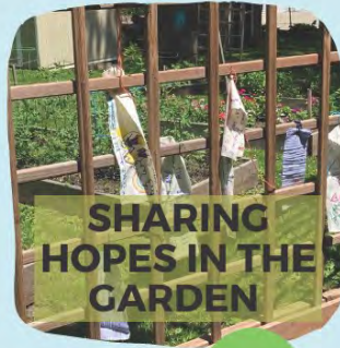
SHARING HOPES IN THE GARDEN