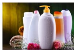
APRIL Shampoo & Conditioner