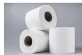
MAY Toilet paper