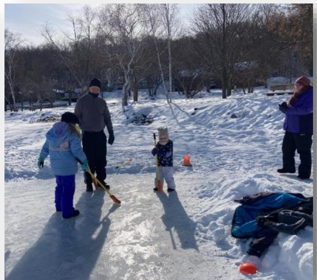
Broomball at Winter Retreat