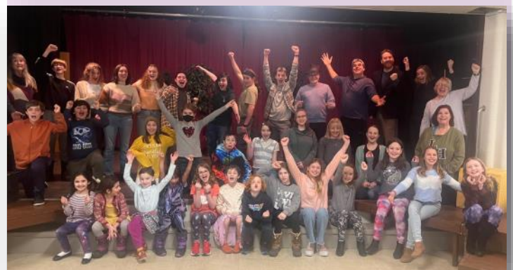
The cast of "Twinderella"

Our free food give-away once a month is a source of food relied upon by many, and it happens through volunteers who come each month. We gather outside on the 4th Saturday of each month. You can volunteer anytime between 6:30 and 10:30 a.m. We start setting up at 6:30, unload the truck starting at 7, serve the food starting around 7:30, and are usually done cleaning up by 10:30. Join us for all or any portion of that time, dress appropriately for the weather, and bring a friend! We'll be offering food on February 25 and March 25.