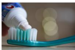
MARCH Tooth paste and brushes