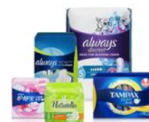
AUGUST Feminine Hygiene