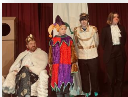
Moments from “Twinderella”