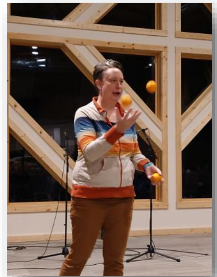
Showing our talents at Winter Retreat!