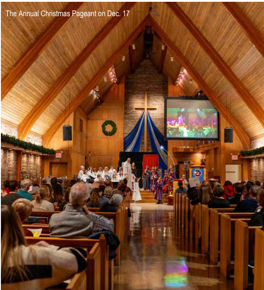
The Annual Christmas Pageant on Dec. 17