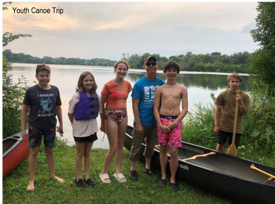
Youth Canoe Trip