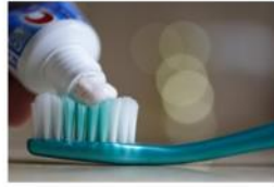
MARCH Tooth paste and brushes