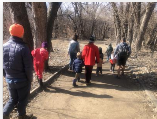
Family Fun Day at Wood Lake Nature Center