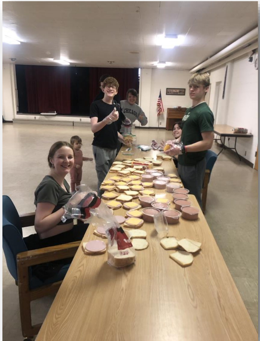
Our Youth made sandwiches for the Dignity Center