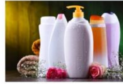
APRIL Shampoo & Conditioner