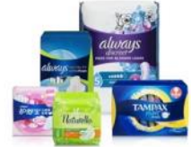
AUGUST Feminine Hygiene