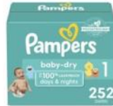
JUNE Diapers, sizes 3,4,5 Open box OK