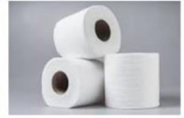
MAY Toilet paper