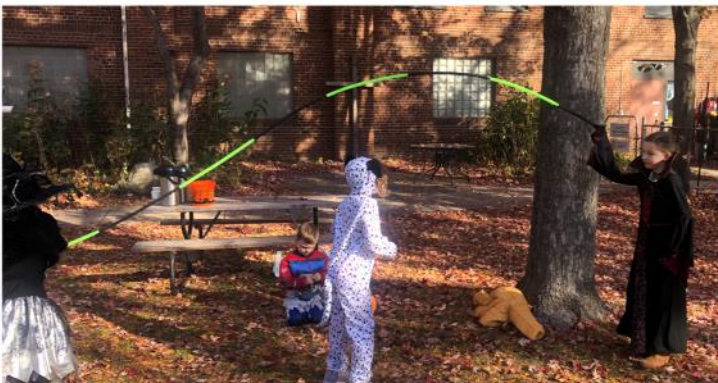
Halloween Parade fun!