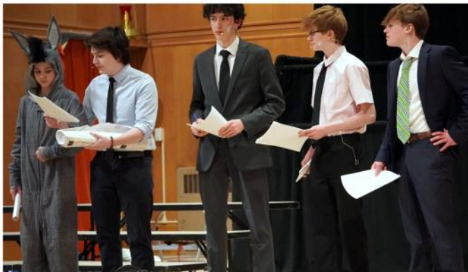
2024 Christmas Pageant