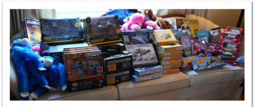
Some of the toys from our 2024 Toy Drive