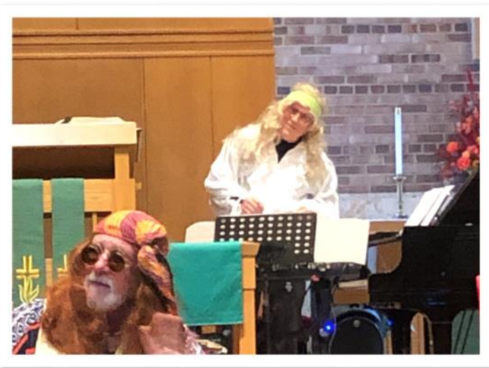
Fall Harvest Dinner and Variety Show

Babies and toddlers with their caregivers are invited to stop by each Thursday morning at church for a time of play and community. Playgroup meets upstairs in the nursery and preschool rooms. Follow the “Minnehaha Playgroup” on Facebook for more information.